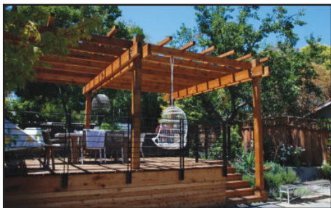
Specht Residence by Past the Gate, Large Residential Installation