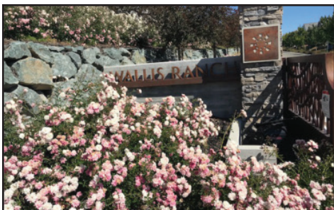
Wallis Ranch by Allied Landscape, Large Residential Maintenance