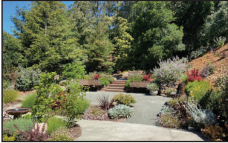
Adams Residence by Suma Landscaping, Medium Residential Maintenance