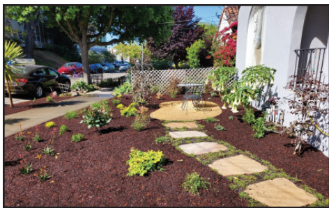
Bailey Residence by Suma Landscaping, Petite Residential Installation