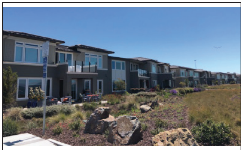
Waterline Place by Allied Landscape, Large Residential Maintenance