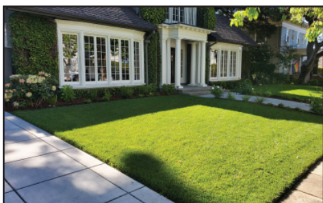
Mathis Residence by Suma Landscaping, Custom Residential Installation