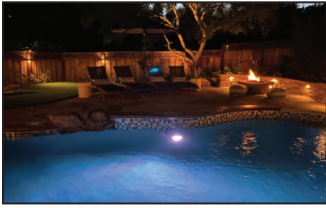
Lind Residence by Garden Light Landscape Development, Special Effects Installation