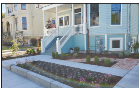
Devlin Residence by Suma Landscaping, Small Design/Build Installation