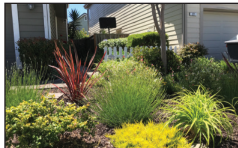
Freeport HOA by Suma Landscaping, Renovation Installation

Sponsored by: Vision Recycling Achievement: Suma Landscaping Project Name: Freeport HOA