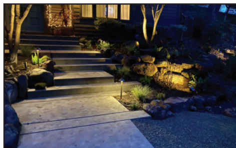
Blanchard Residence by Garden Lights Landscape Development, Medium Design/Build Installation

Sponsored by: Bee Green Recycling and Supply Achievement: Tree Sculpture Group, Terra Landscape Project Name: Arcadia Park Sponsored by: SiteOne Landscape Supply First Place: Suma Landscaping Project Name: Devlin Residence