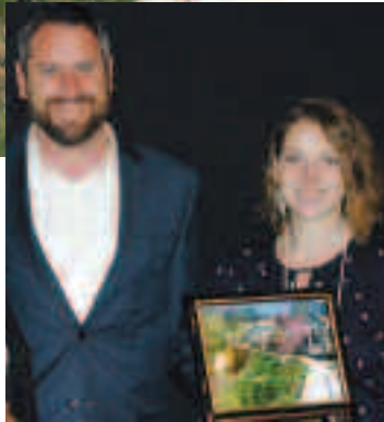
At right: JPA Landscape & Construction accepts the Judges Award in 2018.