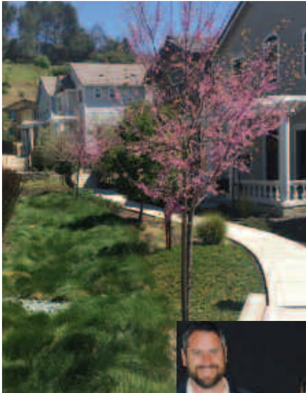
Above: Orinda Grove by JPA Landscape & Construction, winner of the Judges Award in 2018.