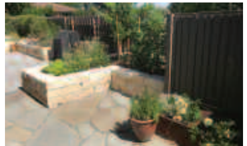
Small Beautiful Cooking Garden, Calvin Craig Landscaping, Small Design/Build