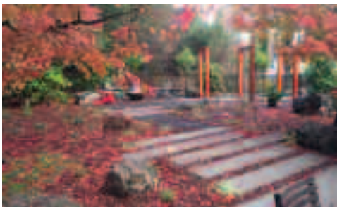
Pool to Garden Reservoir by Roxy Designs, Water Conservation Landscape Installation