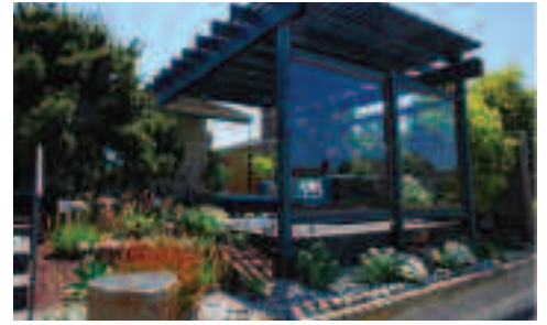
Rothman Residence by Past the Gate, Large Residential Installation