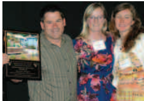
Above: Dynamic Designs accepts the Sweepstakes Installation award.