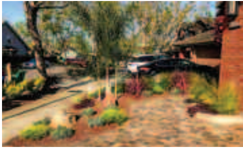
Kallsen Residence by Suma Landscaping, Petite Residential Installation