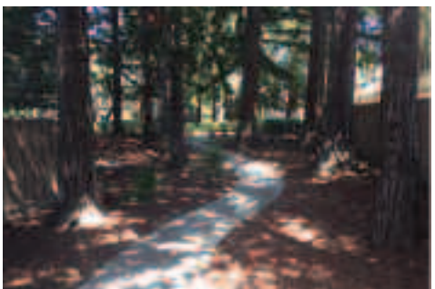
Charter Square HOA by JPA Landscape & Construction, Large Commercial Maintenance