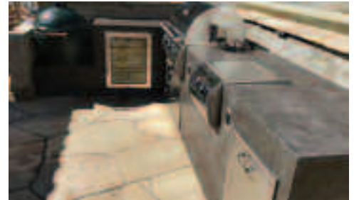
Holzemer Residence by Garden Lights Landscape Development Inc., Custom Residential Installation