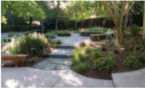
Life After Lawn by Calvin Craig Landscaping, Renovation Installation