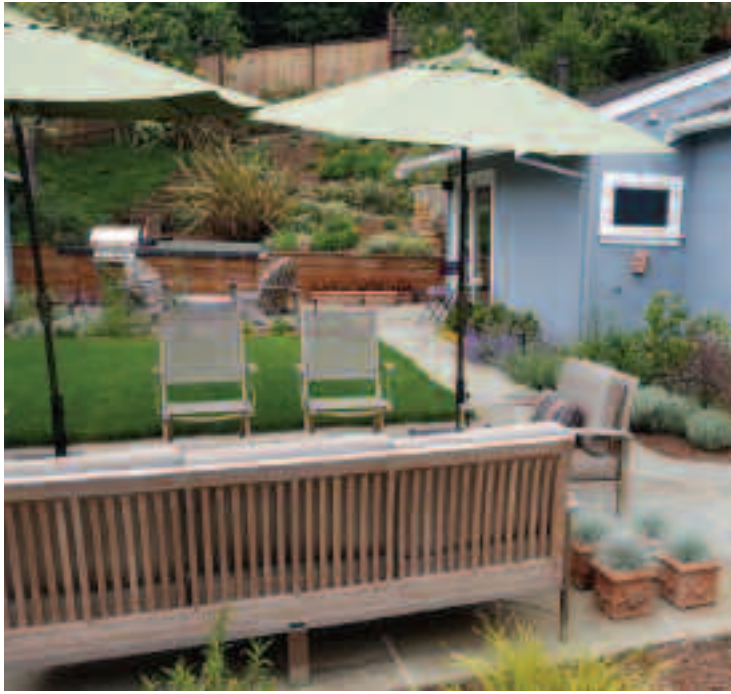
Above: Contemporary Craftsmanship by Dynamic Designs winner of the Sweepstakes Installation Award.