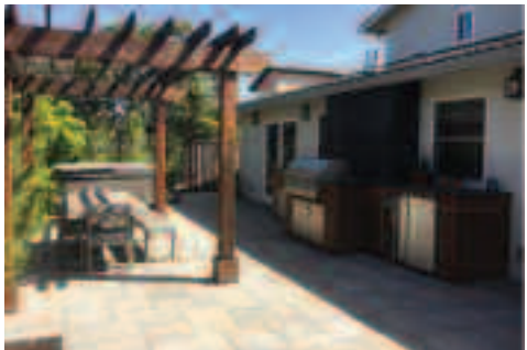
Contemporary Beachside Garden by Roxy Designs, Medium Residential Install