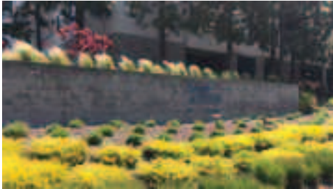
Bayside Commons Courtyards by Terra Landscape, Sustainable Landscape Install