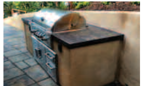
Golden Front & Side Yards by Garden Lights Landscape Development, Medium Design/Build