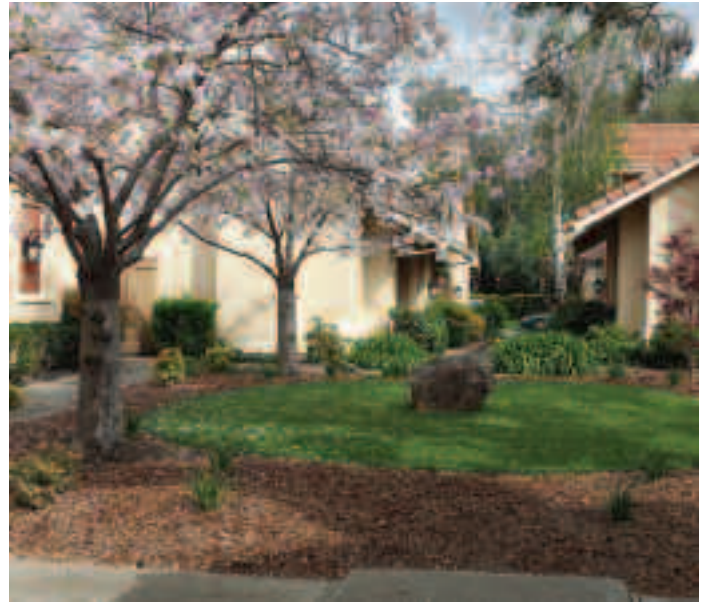
Above: Rancho Dorado by Terra Landscape winner of the Sweepstakes Maintenance Award.