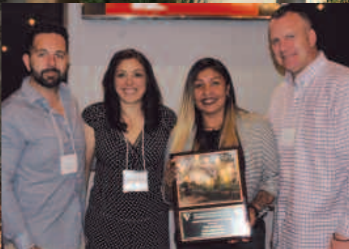
Above: members of the Terra Landscape team receiving the Landscape Maintenance Sweepstakes Award on June 7.