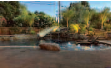
Biener Residence, Garden Lights Landscape Development, Custom Residential Installation