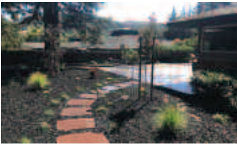
Tom Residence by Suma Landscape, Large Residential Installation