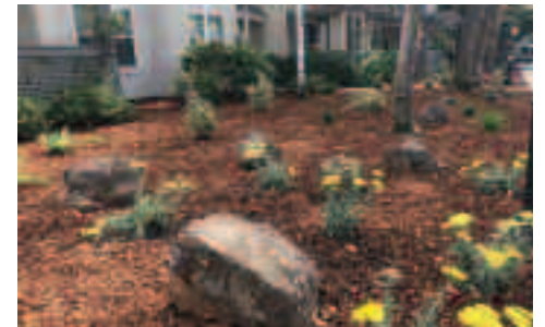
Waterford Sustainable Rehabilitation, Terra Landscape, Sustainable Landscape Install

Project Name: The Waterford Sustainable Rehabilitation