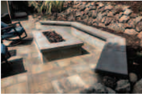
Nolan Residence, Garden Lights Landscape Development, Medium Design/Build