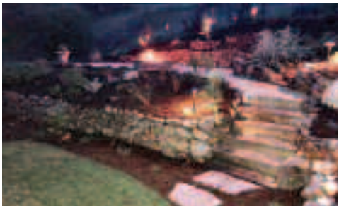
Tringale Lighting Project, Garden Lights Landscape Development, Special Effects Lighting