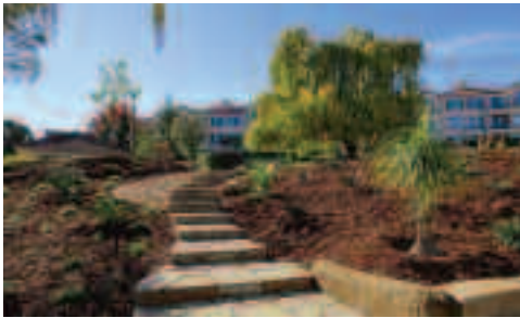
Eagle's View Plaza, Allied Landscape, Large Design/Build