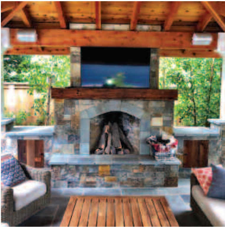
Above: Hiatt Residence by Garden Lights Landscape Development Inc., winner of the Sweepstakes Installation Award.

The CLCA East Bay Chapter recognized the work of chapter firms on Friday, June 7 at Canyon Lakes Golf Course and Brewery in San Ramon during the Annual Beautification Awards. Thank you to everyone who came out to enjoy the evening and witness the wonderful landscape construction and maintenance work being done by chapter members.