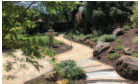
Decked Out by Roxy Designs, Medium Residential Installation