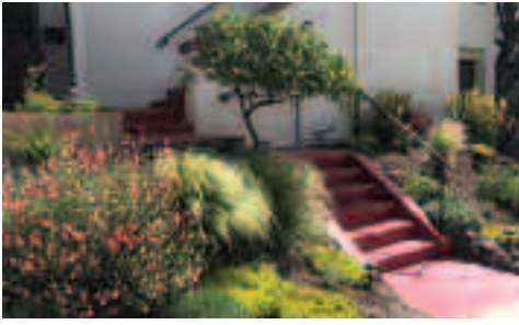
Rubin Residence by Suma Landscaping, Petite Residential Installation