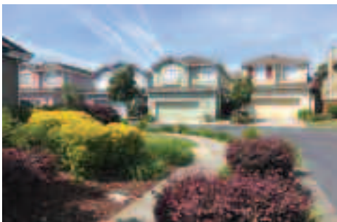
Freeport Community, Suma Landscaping, Large Commercial Maintenance