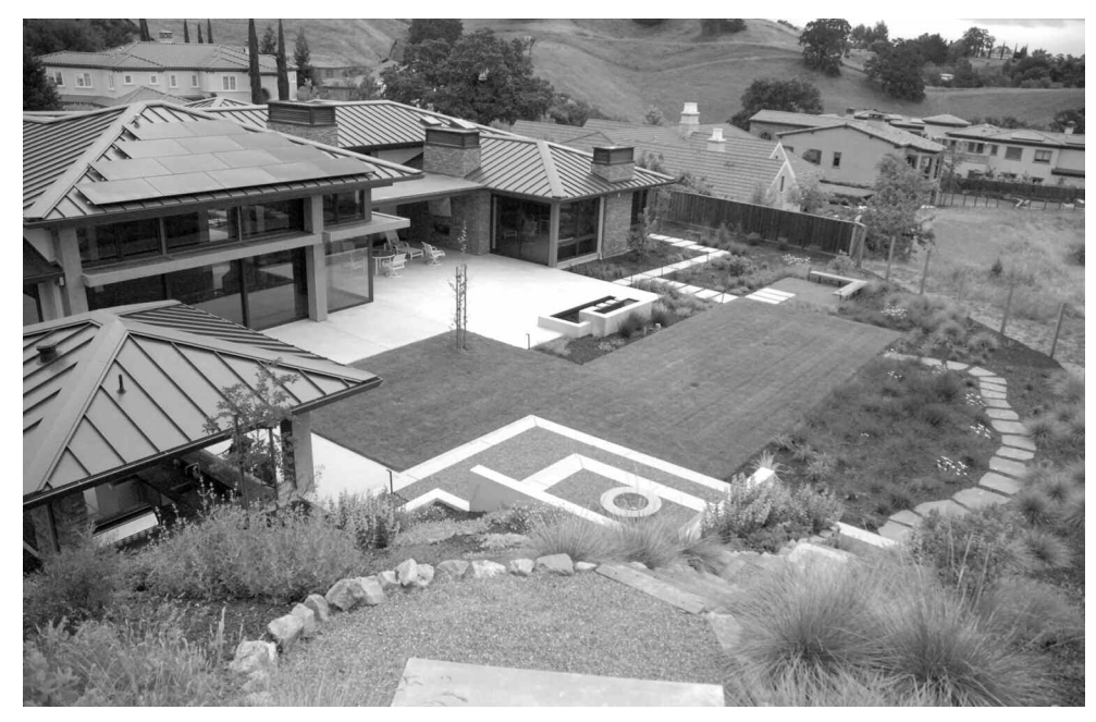
Contemporary Hillside Oasis. 2017 Judges Award - Roxy Designs