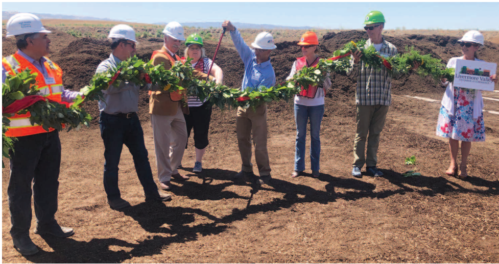
Above: The Livermore Chamber of Commerce, CalRecycle state officials, stakeholders from the organics industry and Vision's clients were on hand to witness the cutting of the ribbon, which was a leafy garland. The garland was then recycled with the green waste.