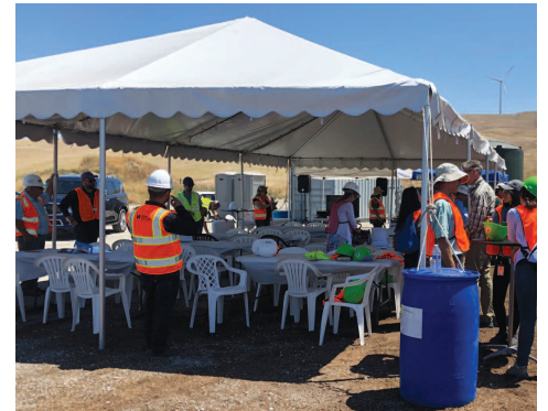
Forty people were given a tour of the new facility which included the compost technology, lunch, and a grinding demonstration of wood debris.