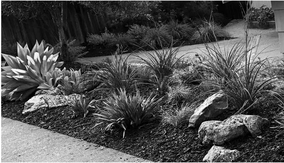
Ortega Residence by Indian Rock Landscapes